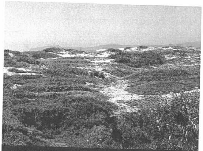
Portolá Camp #4 has changed significantly from Portolá's time. In 1769, the various creeks flowing into the Pacific were open to the sea and required bridging before the expedition could pass.