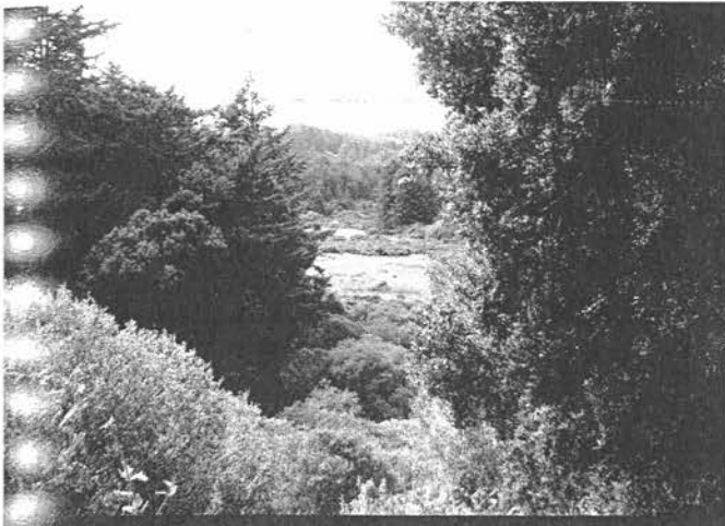
This photograph of the Quiroste Valley Cultural Reserve within the Año Nuevo State Reserve is taken to the north from the valley's south rim. This is in probably the site of Portolá Camp #1.

since the expedition campsite was adjacent to a village that surrounded the Casa Grande , an unusual structure big enough to accommodate the 200 or so Ohlones. There are few, if any, diary references to native villages with permanent or significant buildings that the expedition encountered and, thus, the Casa Grande , as well as the pine-woven homes of the residents, were worthy of note.